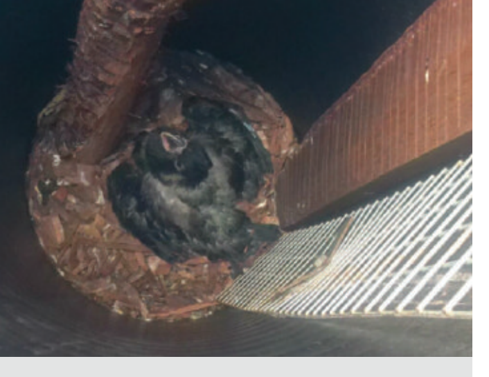
Carnaby chick captured during January monitoring – he/ she is just a few weeks old but starting to show more feathers and the distinct Carnaby tail colours. Mum and dad have been seen maintaining a keen watch over the nursery.